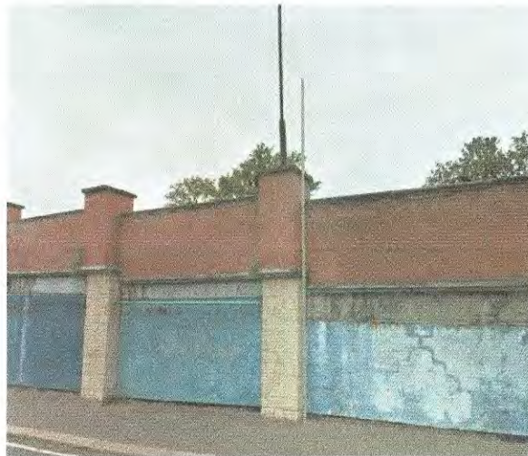
LOCATION B WITH POLE