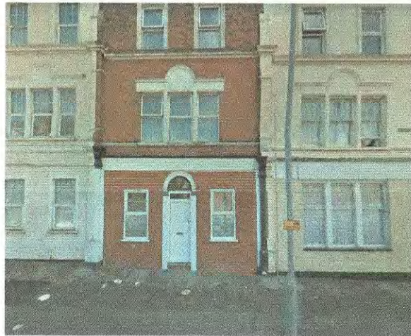
LOCATION A WITH POLE