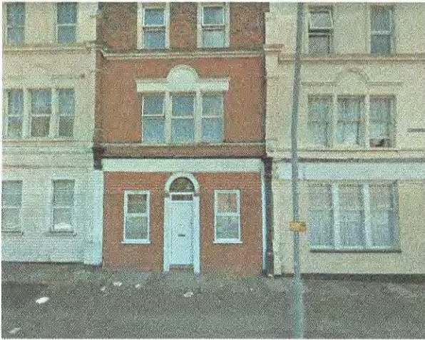
LOCATION A WITHOUT POLE