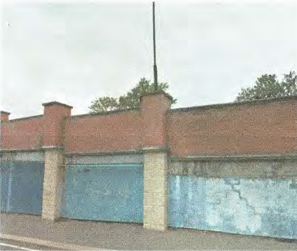
LOCATION B WITHOUT POLE